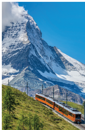
The Gornergratbahn open-air railway

Day 12: Salzburg Our walking tour this morning features the the 17 th -century Mirabell Gardens; the Baroque Old Town, now a UNESCO site; and visits to Salzburg Cathedral and medieval Hohensalzburg Fortress, one of Europe’s largest and best-preserved castles. This afternoon and evening are free for further exploration and lunch and dinner on our own. We have the opportunity to be in the city during the celebrated Salzburg Festival showcasing classical music and performing arts (no formal activities planned). B