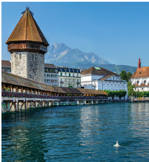
Lucerne’s beloved Kapellbrücke (Chapel Bridge)