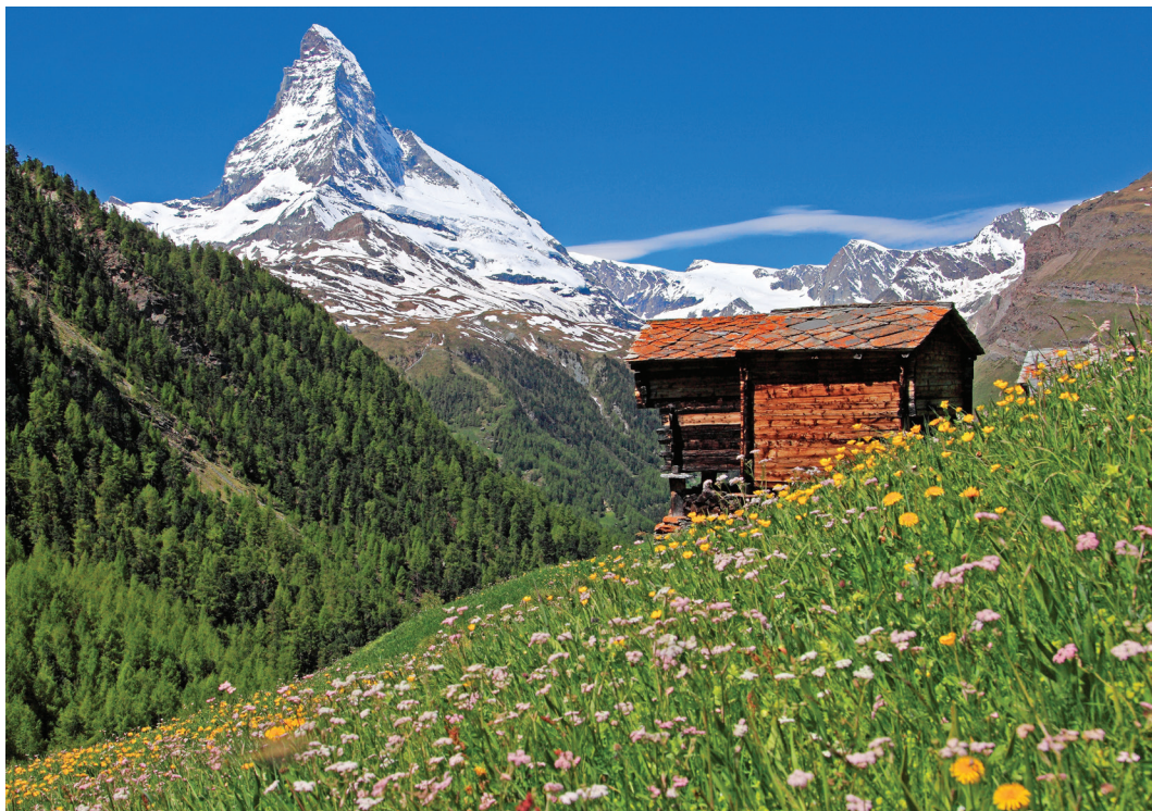
The Matterhorn presides over charming Swiss villages and meadows dotted with wildflowers.

Pass through the Alps. Late morning, we arrive in Stresa, Italy, along the shores of lovely Lake Maggiore, where we have time to explore and enjoy lunch on our own. Then a scenic drive through the famed Italian lake district returns us to Switzerland and our hotel in lakeside Lugano. B,D