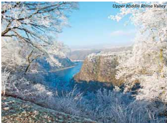
Upper Middle Rhine Valley